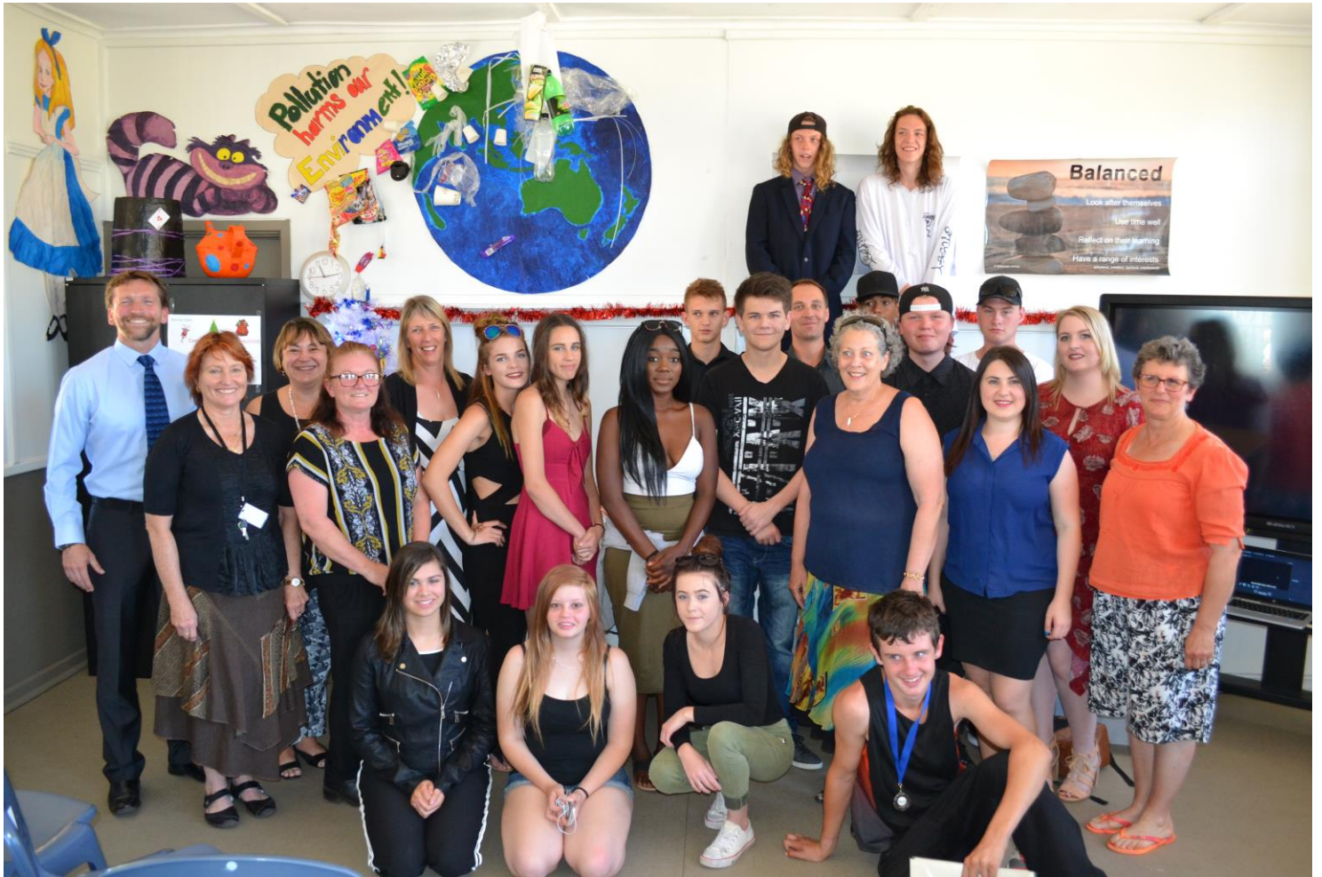
Some of the Comet graduates.